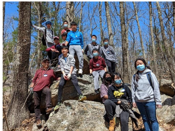
Posing on a Giant Rock