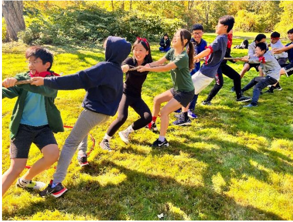
Tug-of-war during Youth Retreat