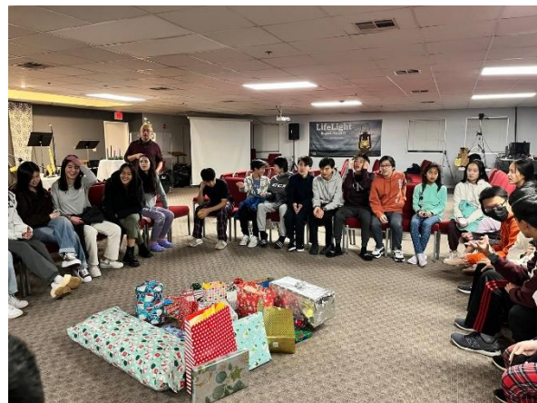
White Elephant Gift Exchange