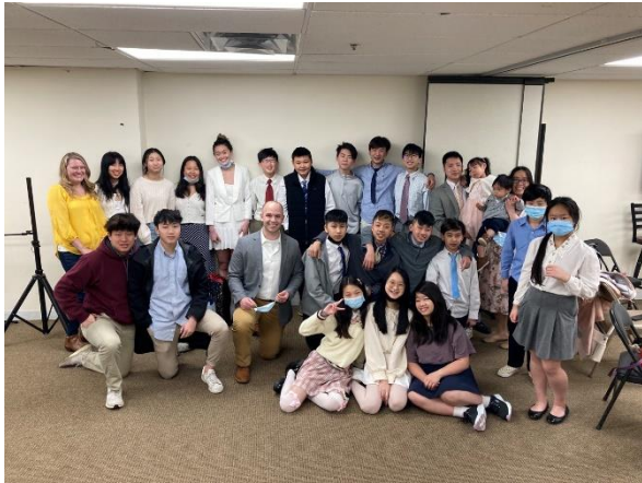
Easter Group Photo