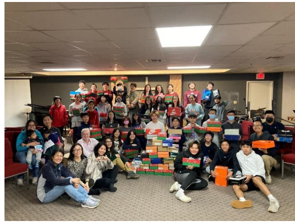
We packed 97 shoeboxes this night!