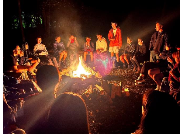
Campfire sharing during Youth Retreat