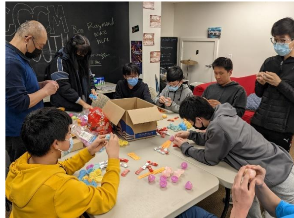
Packing Easter Eggs for Children Ministry