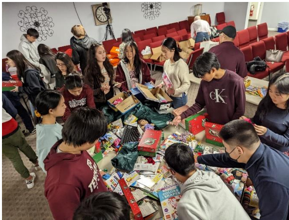
Operation Christmas Child Shoebox Packing