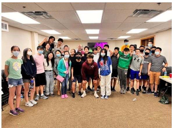
Senior Graduation Celebration