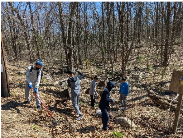
Earth Day Community Service Clean-up