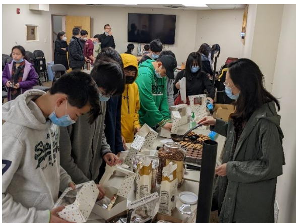
Packing Snack Boxes for Mother's Day