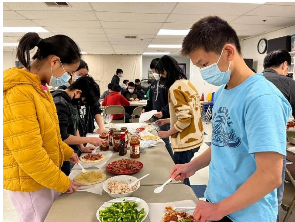
Welcome Back Pizza Fellowship!