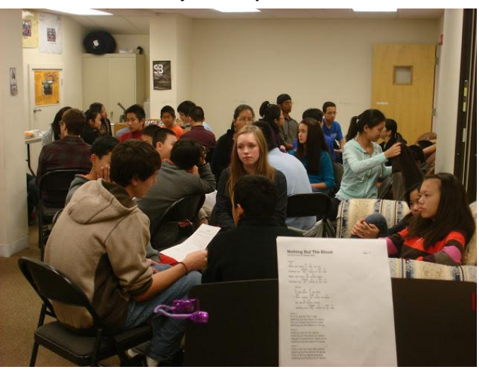
Small groups during Sunday school