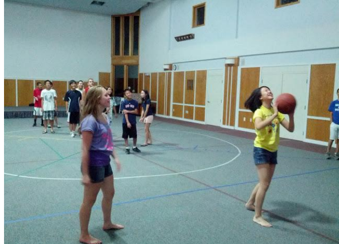
Friday night game time