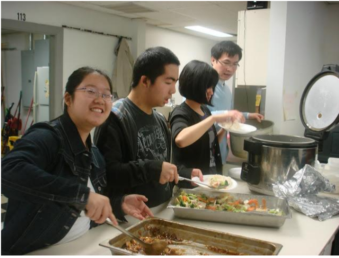
Serving at lunchtime